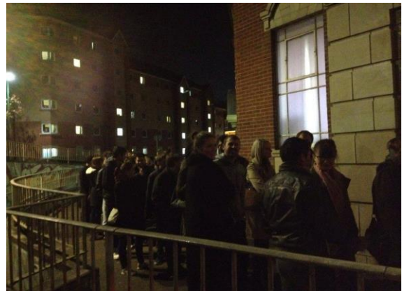
The queue outside Central Hall 10 minutes after the concert was due to start.